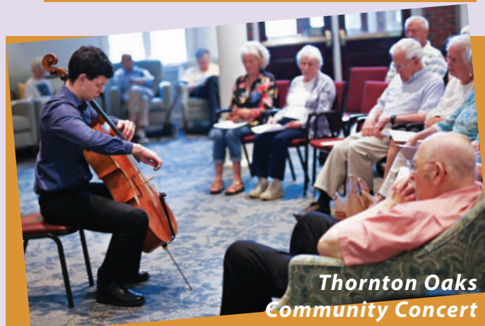
Thornton Oaks Community Concert