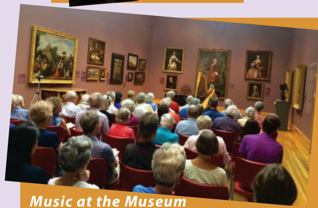
Music at the Museum